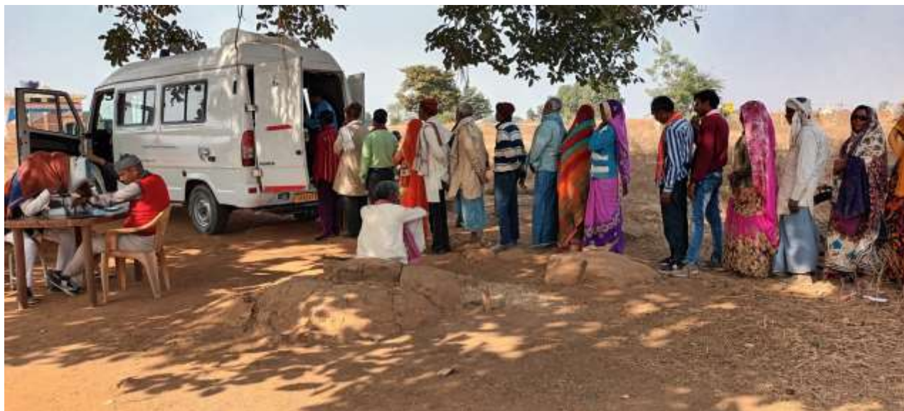
Mobile Telemedicine Unit (MTU)

In rural Uttar Pradesh nearly 60 percent of the total rural population lives below the poverty line. Our Mobile Telemedicine Units offer flexible and viable options to offer healthcare facilities to these vulnerable groups. Our Mobile Telemedicine Units (MTUs) help to conduct screenings, basic diagnosis and provide primary healthcare services to complex medical treatments closer to people's homes.