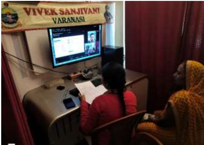
Psychiatric Doctor Consultation in Majhawan STU

RAMAKRISHNA MISSION HOME OF SERVICE (GENERAL HOSPITAL) LUXA, VARANASI, U.P.-221 010, India (A Branch Centre of the Ramakrishna Mission, Belur Math, Howrah) Website: www.rkmkashi.in Email: viveksanjivani.kashi@gmail.com