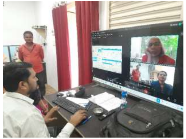
Gynaecologist Doctor Consultation in Kalwari STU