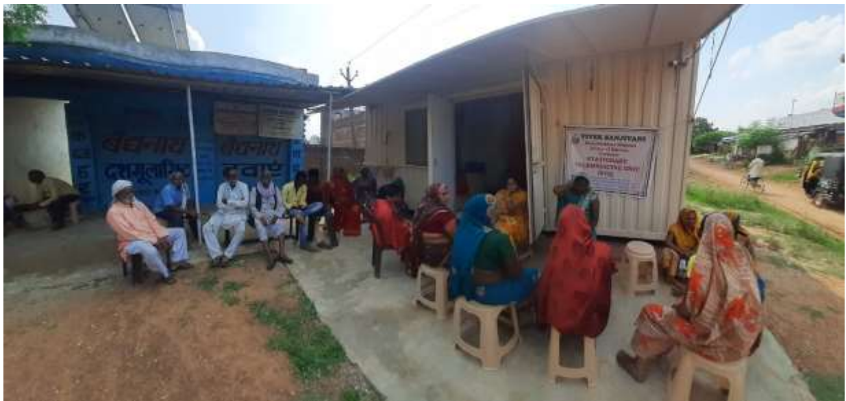
Prefabricated Stationary Telemedicine Unit (STU) at Kalwari